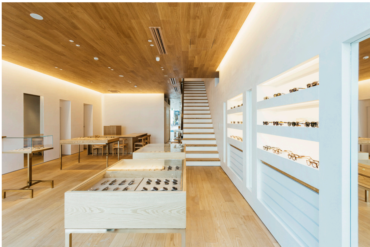
EYEVAN 7285 TOKYO