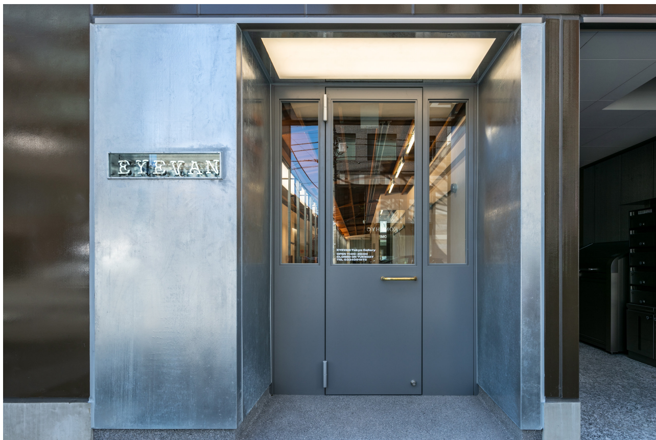
EYEVAN Tokyo Gallery